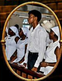
COMMUNITY Our Strength