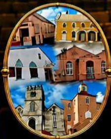
HERITAGE Our Legacy