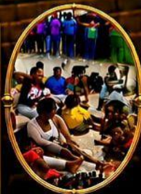
FUTURE Our Calling