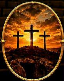
FAITH Our Foundation