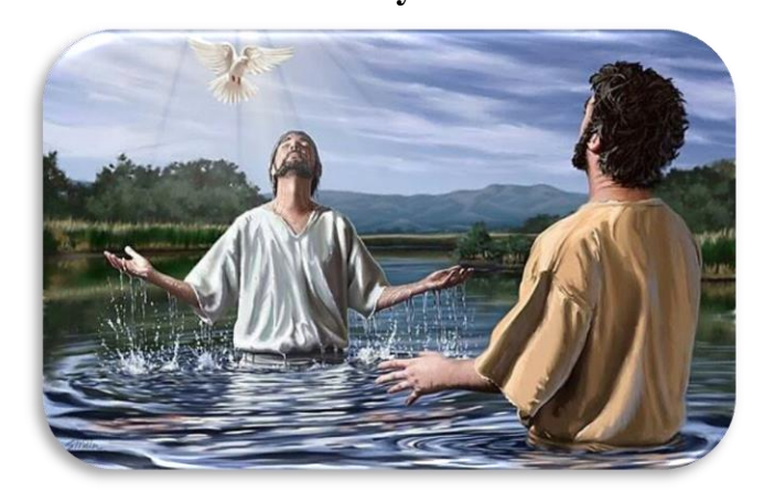
Sunday, January 9, 2022 First Sunday after the Epiphany